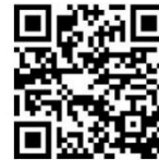
Care Convoy QR Code